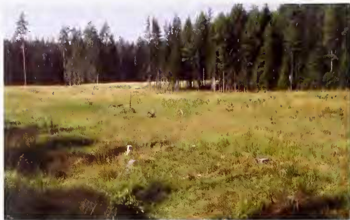
Fig. 2. Habitat east of Wigierski National Park where our P. falcata record was found.

tends the known range within Poland for about (appr.) 300 km northeastwards and immediately links it with the first Lithuanian record from 2008. The locality (Fig. 2) is situated less than 20 km from the Lithuanian border and closely corresponds to the new and single Lithuanian locality of this thermophilous species which is situated in the Lazdijai district at 54.12N and 23.50E (Ivinskis & Rimsaite 2008) (Fig. 3). Our specimen is deposited in the Orthoptera collection of the Zoologisches Forschungsmuseum A. Koenig (ZFMK) in Bonn.